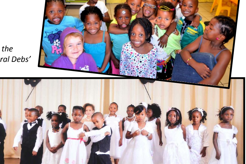
Below: the inaugural Debs' Ball