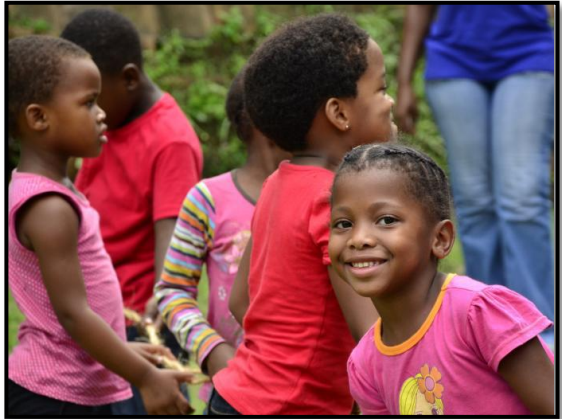
Tug of war

parents also came, to support their children. The day started in the church with a chapel service and awards to the 'Stars of the Week'.