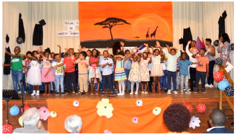
The school sang the National Anthem

The Concert was wonderful as usual and the children entertained us with song, dance and recitation.