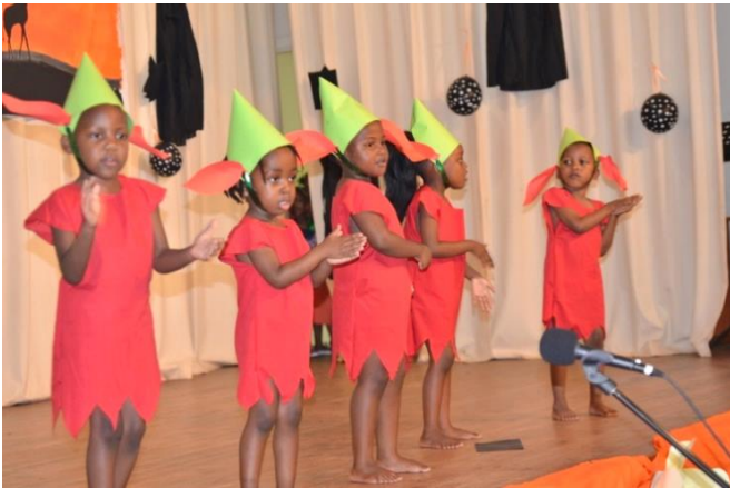
Grade 000 were 'elves'

The Concert was wonderful as usual and the children entertained us with song, dance and recitation.