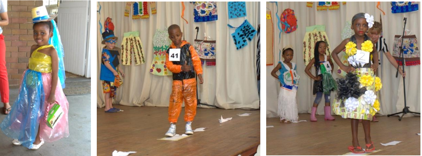
Some of our Trash Fashion Show entrants