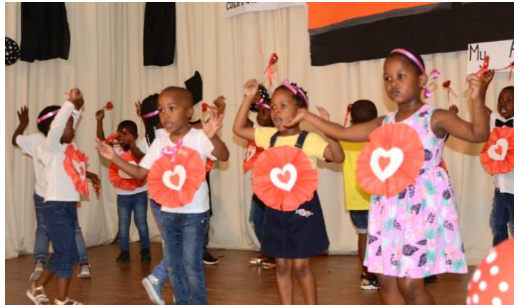
Grade 00 with 'loving hearts'

As usual it was very difficult to say goodbye to the children who were leaving us to enter Grade 1 at local Primary Schools – they become very precious to me during the time they spend at Udobo School and fill my days with fun and hugs – always lots of hugs!