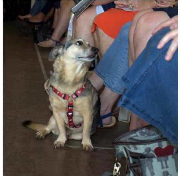
Skippy, The Rev Cole's dog, attends all the church functions