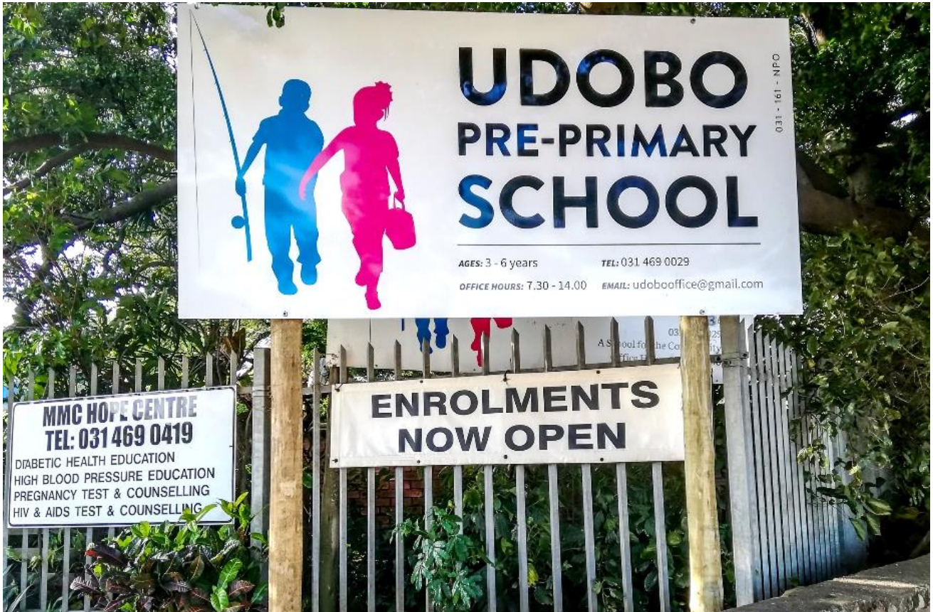
The Street sign