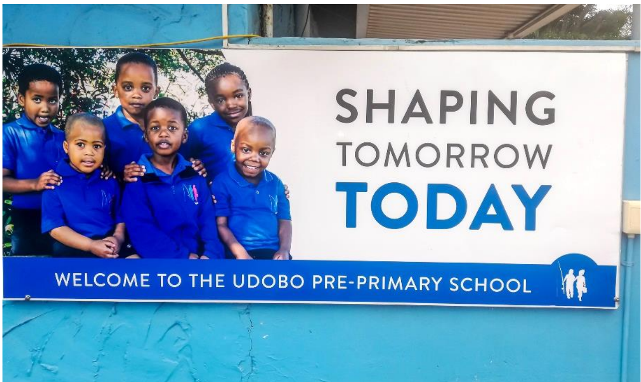
The diveway sign at the main entrance gate

The Udobo Pre Primary School is funded through parents' contributions, fundraising and donations from charitable organisations. Telephone & Fax +27 (031) 469 0029 E-mail: anueudobo@gmail.com Website: udoboschool.com Fund-raising No. 031-161-NPO