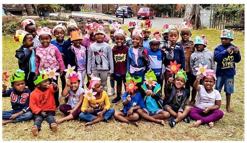
Spring Celebration day at Udobo School