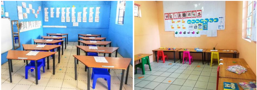
Social distancing in the classroom

We did have a very low key celebration for Heritage Day on the 24 th September – this was a public holiday so we had Tuesday and Wednesday where the children could dress in their cultural outfits. We treated them to vetkoek and polony, which was thoroughly enjoyed!