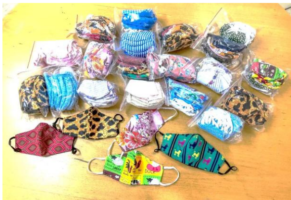
Children's masks were lovingly made by the women of Yellowwood Park Evening Women Institute