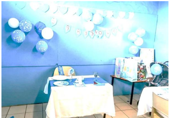
pg. 6 The Udobo Pre Primary School is funded through parents' contributions, fundraising and donations from charitable organisations. Telephone & Fax +27 (031) 469 0029 E-mail: anneudobo@gmail.com Website: udoboschool.com Fund-raising No. 031-161-NPO