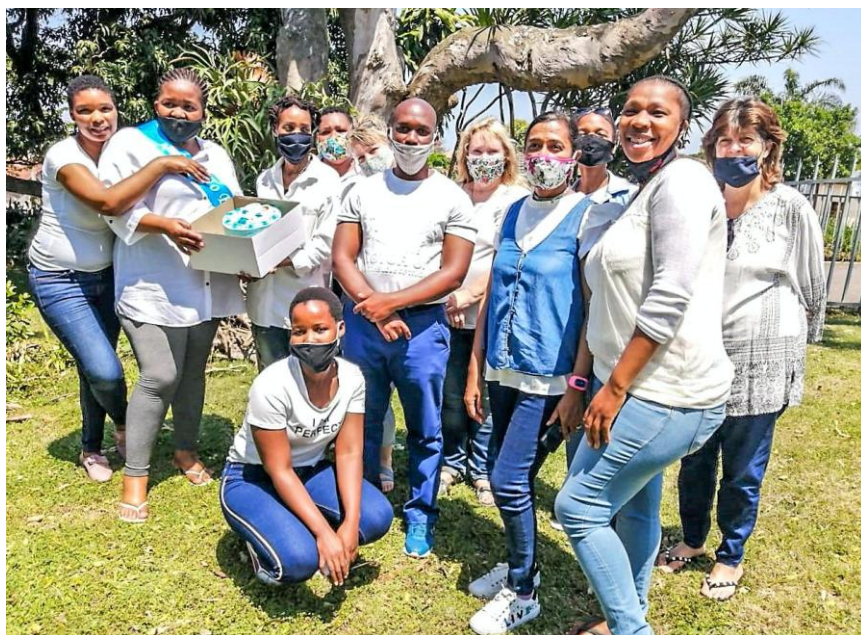
pg. 7 The Udobo Pre Primary School is funded through parents' contributions, fundraising and donations from charitable organisations. Telephone & Fax +27 (031) 469 0029 E-mail: anneudobo@gmail.com Website: udoboschool.com Fund-raising No. 031-161-NPO